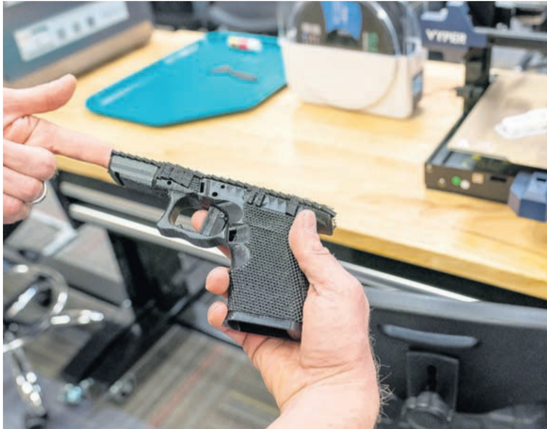
A handgun frame that has been printed on a 3D printer is held for a photograph at the Bureau of Alcohol, Tobacco, Firearms, and Explosives (ATF), National Services Center, Thursday, March 2, 2023, in Martinsburg, W.Va